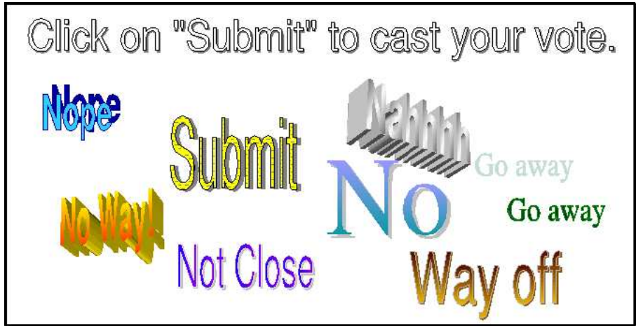
Figure 2. A variety of options can be presented as text rendered as a complex image so that, although it’s answerable with a single click, several bits of confidence are gained. The varying styles of the rendering can make this a challenging test for OCR programs, while it remains simple enough for humans that failure is a strong indicator of an attempted robot attack.