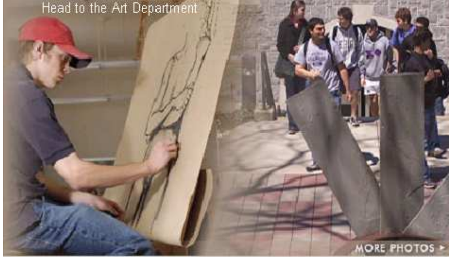
Figure 1. An unconscious CAPTCHA in the form of a link on the text “MORE PHOTOS,” rendered as an image. Such link text can be rendered deliberately to be difficult for machine readers, to form one in a series of effective implicit CAPTCHAs.

to porn sites). Some of the first generation of CAPTCHAs have already been broken (see, e.g. , [CB03,MM03]) and so the next generation must be made stronger and thus, unless we are careful, are likely to be even more difficult and awkward for human users.