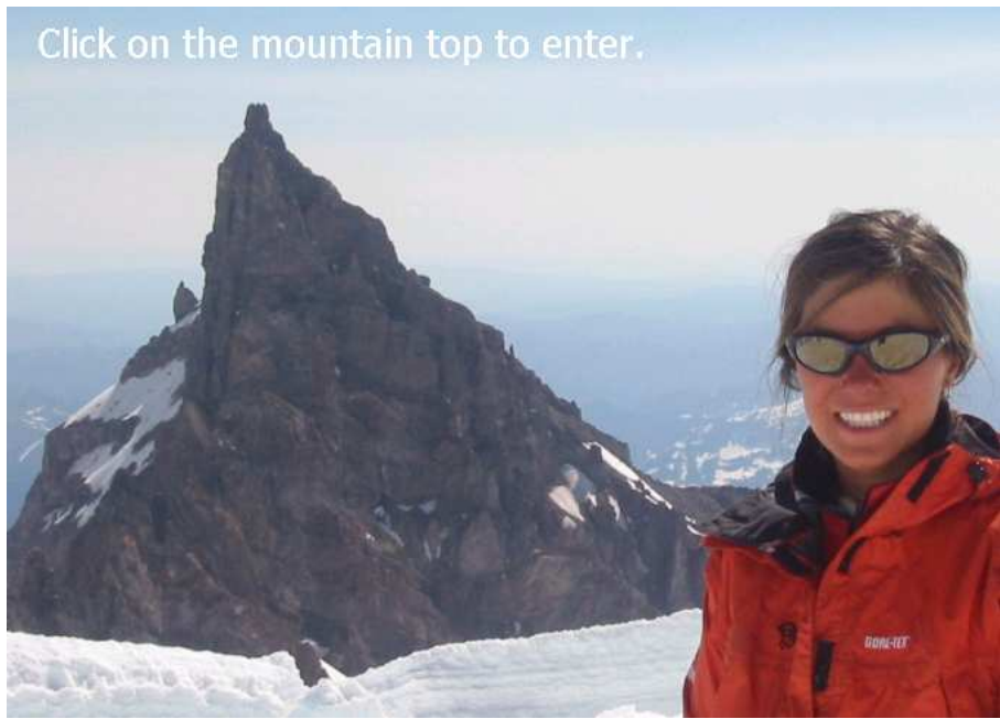
Figure 3. A friendly greeting page is an implicit one-click CAPTCHA.