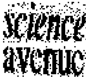
Figure 2. Examples of synthetically generated images of printed words which are machine-illegible due to degradation parameter thrs = 0.02.

What is more, on almost all of these words, no machine guessed a single alphabetic letter, either correctly or incorrectly. The following figures shown a selection of machine-illegible and machine-legible word images.